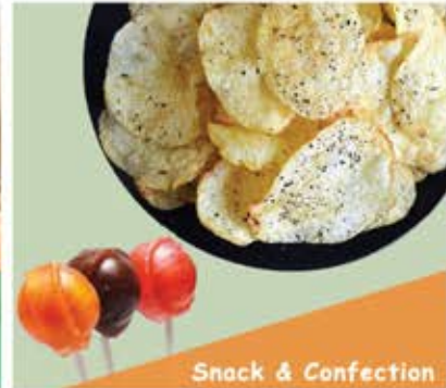
Snack & Confection