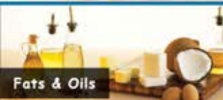
Fats & Oils