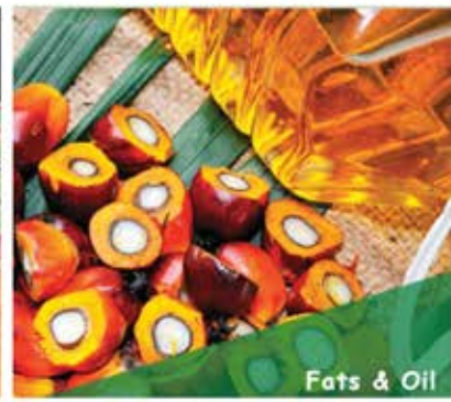
Fats & Oil