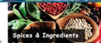
Spices & Ingredients