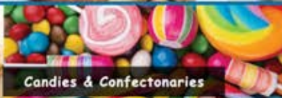
Candies & Confectionaries