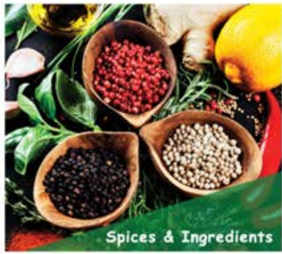
Spices & Ingredients